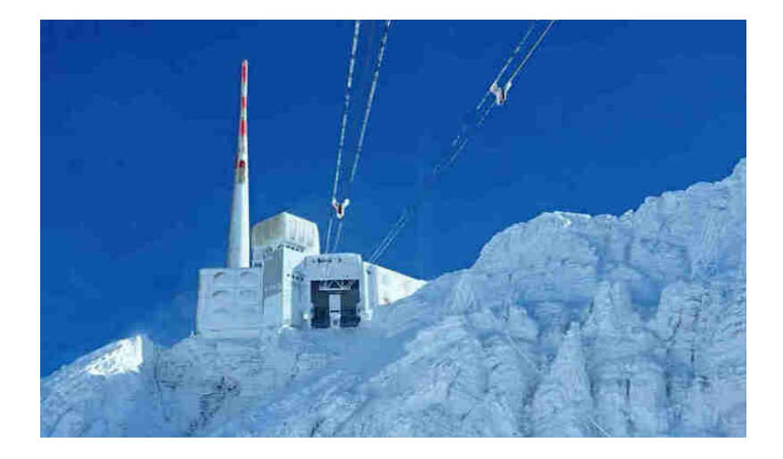
Fig.3. Laser lightning rod on Mount Sentis (Switzerland).

In the course of its operation, a long ionized channel is created through which the lightning deflects from the protected places. The range of the laser is sufficient to protect large areas with forests and infrastructure [6]. This is a big breakthrough in lightning protection.