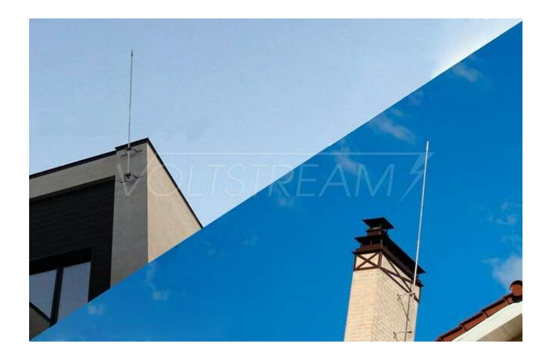
Fig.1. Passive and active lightning rods.

Since the Russian scientist Lomonosov suggested the electrical nature of lightning, and the American scientist Franklin (18th century) established that lightning is a dangerous manifestation of atmospheric electricity, mankind has been looking for a means of protection against this phenomenon. In 1752, Franklin installed a 9-foot-high metal rod on the roof of his house and wired it to a well. The wire ran through the house and connected to an electric bell. Lightning struck the rod and triggered the bell. This invention became the forerunner of modern grounded lightning rods. It should be noted that, despite the many technologies and devices, the principle laid down in 1752 is fundamental and effective. Currently, there are two types of lightning protection: passive and active [4].